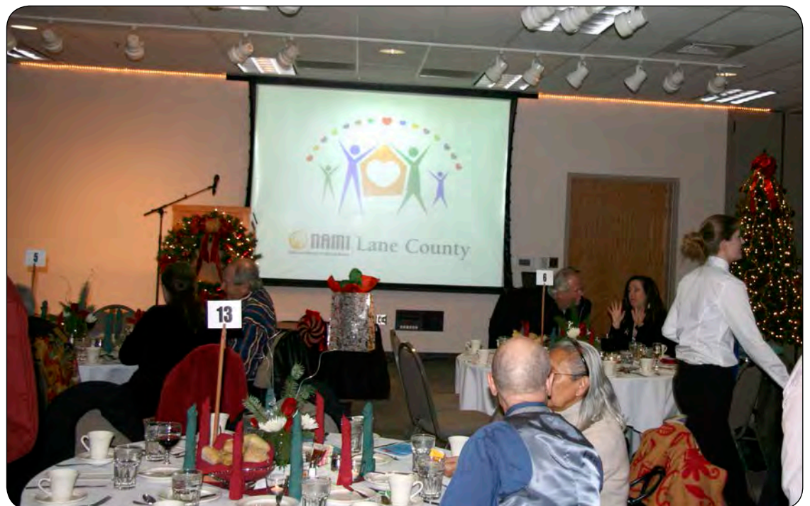
This year's event (December 3 rd ) filled the LCC venue—a great start to the holiday season.